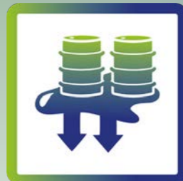
Clean-up Of Own Land