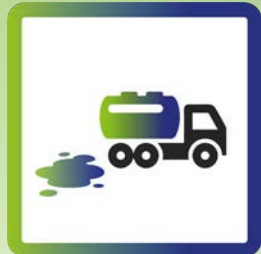
Spillage & Crossover Due To Driver Negligence