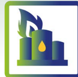
Major Loss Service