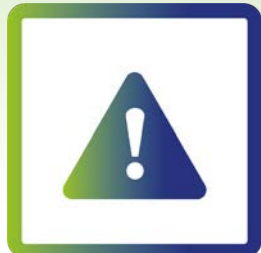
Risk Management Support